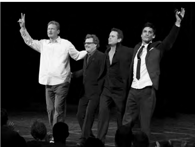
Whose Live Anyway?, April 29, 2010