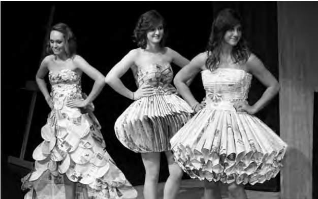
Redesign Fashion Show