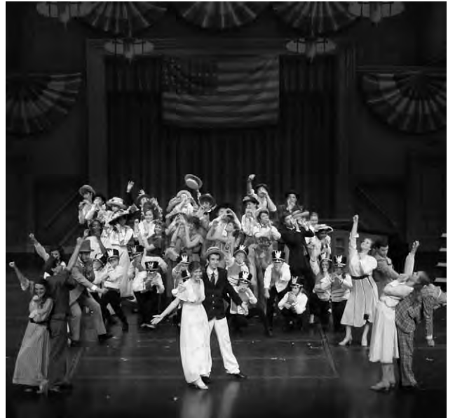
2010 Summerstock production of Music Man