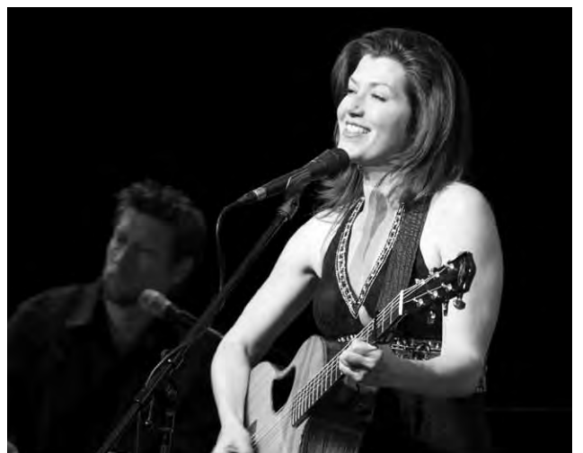
An Evening with Amy Grant, April 17, 2010