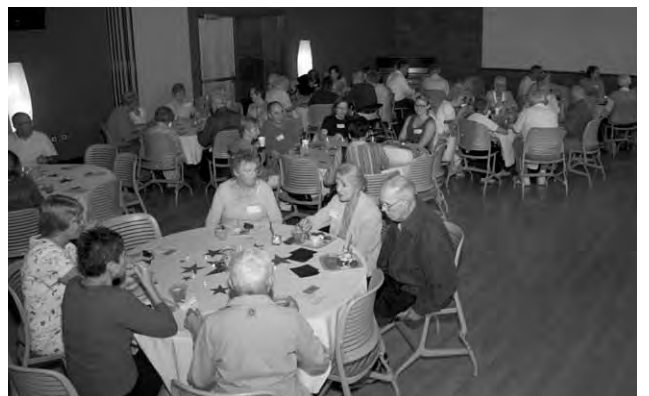
FAC Volunteers at the annual Volunteer Recognition event