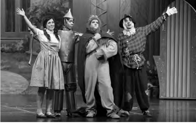
Forest Hills Central's production of The Wizard of Oz